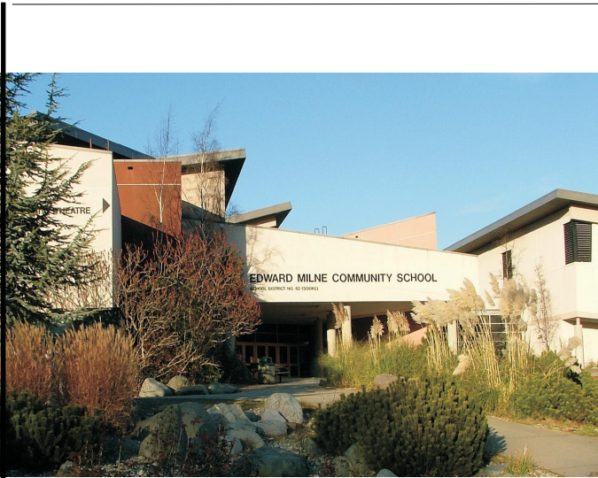
PEKELANEW -Moon that turns the leaves white (Oct.)

EMCS would like to acknowledge the Coast Salish Territory, specifically we would like to acknowledge T'Sou-ke Nation, who have been gracious enough to share the beautiful land on which EMCS is built. We would also like to acknowledge Scia'new Nation, Nuu-chah-nulth: Pacheedaht Nation, and Métis Nation whom EMCS and District 62 work closely with.