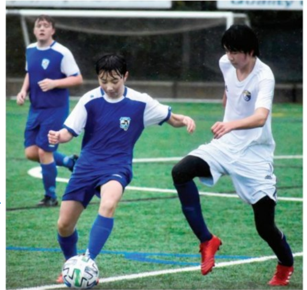
PLAYING FOR KEEPS