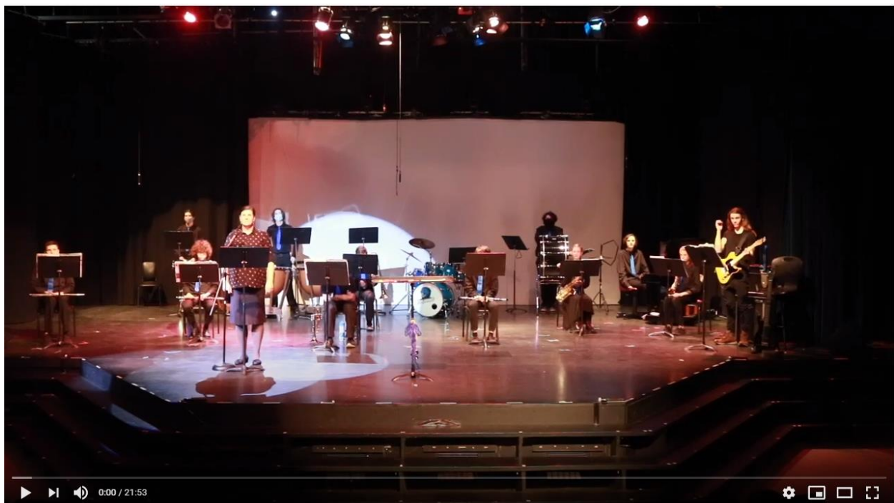
EMCS Band Winter Performance 2020

EMCS Band presents a virtual Christmas performance! Click here to watch it.